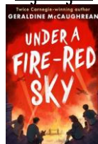
Under a Fire-Red Sky by Geraldine McCaughrean

Remember, there are a range of EXCELLENT online reading books, located on our school website, that you can share with your child at any time.