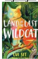
Land of the Last Wildcat by Lui Sit

Remember, there are a range of EXCELLENT online reading books, located on our school website, that you can share with your child at any time.