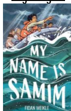
My Name is Samim by Fidan Meikle

Remember, there are a range of EXCELLENT online reading books, located on our school website, that you can share with your child at any time.